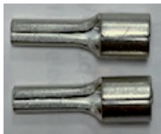
Fig 4.1 Pin type of terminal lugs provided for termination of stranded wiring to be connected to the DC input terminals.

The DC output terminals have a tubular hole with a set screw (See Section 4.6.1 above for specifications). As the DC terminals have been provided with a set screw, do not connect bare stranded wire end directly to the DC output terminal as the strands will spread out when the set screw is tightened and all the strands may not be pinched firmly under the set screw. This will result in (i) reduction in effective area of cross section for current conduction leading to increased voltage drop and overheating along output wiring and (ii) Sparking / loose connection under the set screw leading to overheating / melting of the plastic material of the terminals. The ends of stranded wiring to be connected to the DC output terminals should be crimped to Pin Type of Terminal Lugs that have been provided with the unit (see Fig 4.1). After crimping the Terminal Lugs, use insulating heat shrink tubing or tape to insulate the bare cylindrical portion of the lugs.