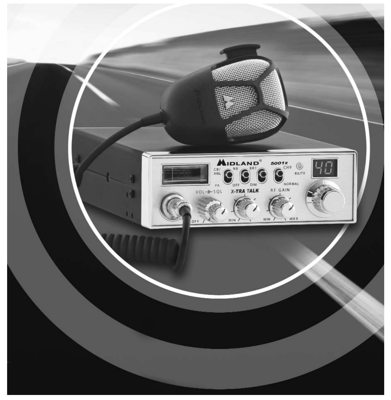
5001z | 40 Channel Citizen Band Mobile Radio Owner's Manual