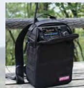
LC-192 Multi-function backpack

The IC-705 fits perfectly in the optional dedicated LC-192 multi-function backpack. It has various functions, such as holes for the antenna and holes for passing through coaxial cable and microphone cable. You can easily operate the IC-705 with it in the backpack.