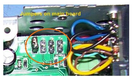
Jumpers on main board behind microphone socket

Radios are usually shipped in this mode. All functions and 24.5 to 29.9mhz continuous coverage. No jumpers.