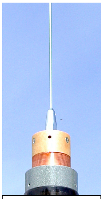
Weathershield removed for discussion only.

For added efficiency, a longer whip may be used. The antenna is constructed so that an eight foot whip may be used.