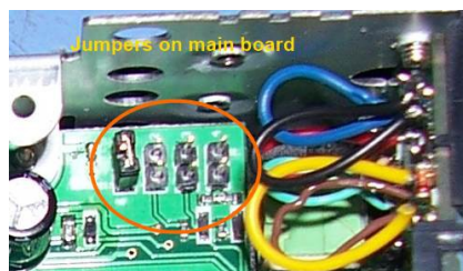
Jumpers on main board behind microphone socket

Radios are usually shipped in this mode. All functions and 24.5 to 29.9mhz continuous coverage. No jumpers.